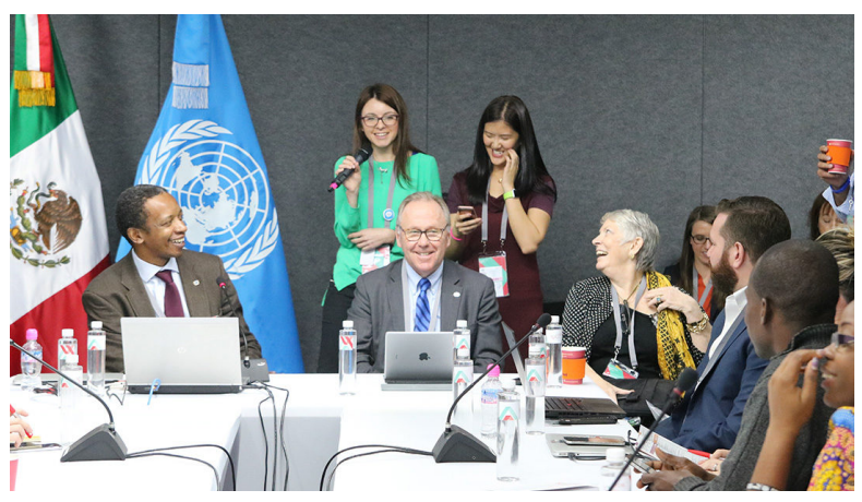
IGF 2016

IGFSA's role as a channel for additional funding for the IGF Trust Fund has been recognized by the UN through an exchange of letters. To date, IGFSA has contributed USD 260,000 to the UN IGF Trust Fund and USD 334,000 to the NRIs.