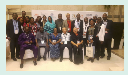
Above: Representatives of NRIs who benefited from IGFSA funding at the African IGF 2018 in Khartoum.

"We are grateful to the IGFSA for supporting the logistics of the first national IGF in the English speaking Caribbean. To ensure the broadest participation, we innovated with a YouTube Live channel to stream the event beyond the confines of the physical location, and support remote participants with full participation. This TTIGF was extremely well received, and has been recognized as a leading IG event in the entire English speaking Caribbean. We are already planning the 2018 TTIGF, and are working with other countries in the region to share our IGF planning process." -T&T IGF